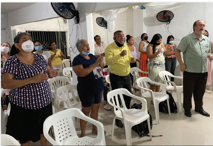
The congregation at worship in Malambo