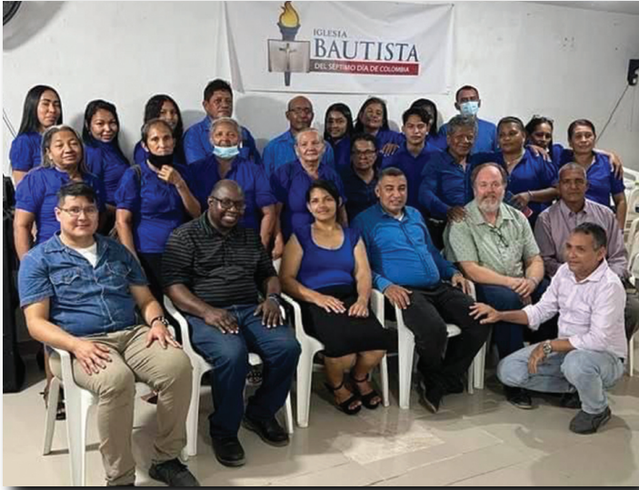
Our Mission Team and some of the congregation at the Malambo Church