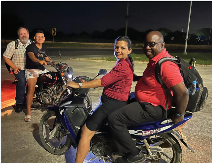
The motorcycle was one of our modes of transportation in Colombia